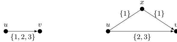
Fig. 2. Example of application of Rule 3.

An example of this rule is given in Rule 3.